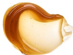
HEMP EXTRACT Cannabis sativa L.

Ingredients: CBD crystalline powder isolated from industrial hemp ( Cannabis sativa L.) extract